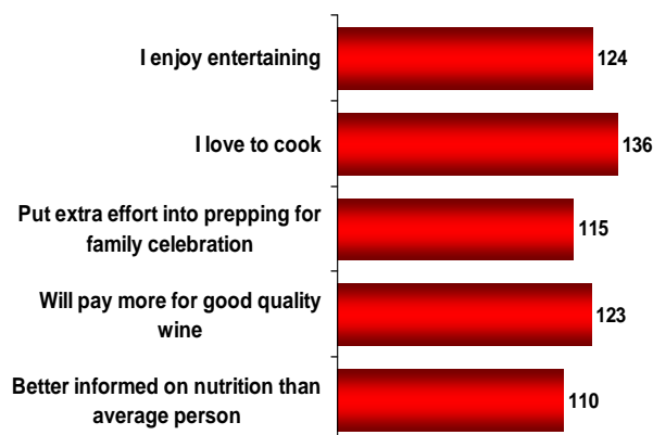
% of A25-54 English Canada Indexed to Population PMB 2009 Spring 2 Year Study